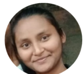
Somee Community Youth