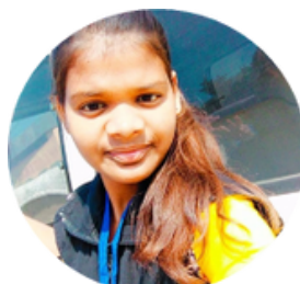
Durga Community Youth