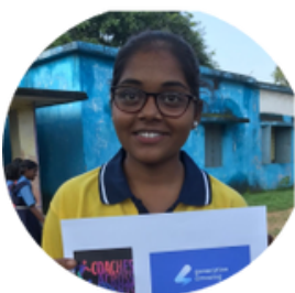
Tripti Community Youth