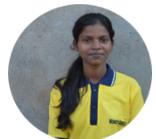
Geetanjali Community Youth