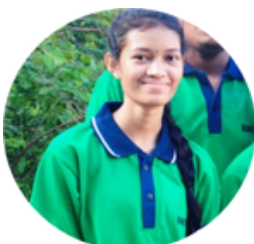
Kanak Community Youth