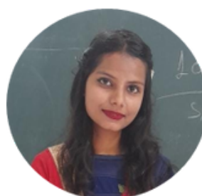
Mushfiqa Community Youth